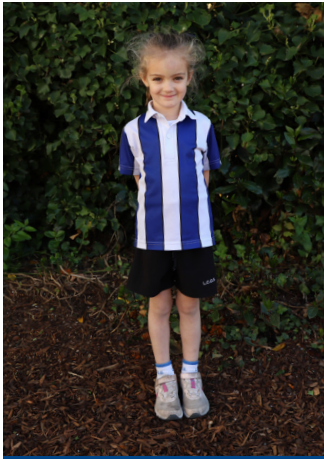
Unisex Sports Summer Uniform