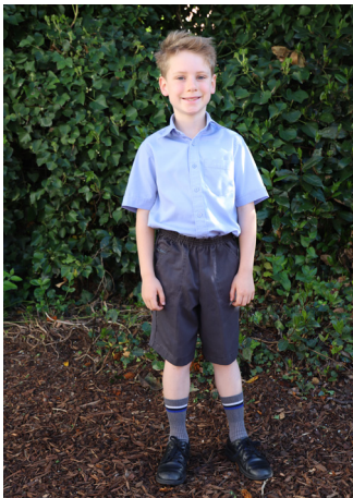
Boys Summer Uniform