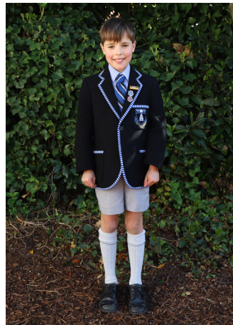
Boys Winter Uniform