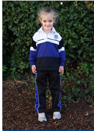
Unisex Sports Winter Uniform