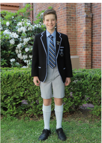
Boys Summer Uniform