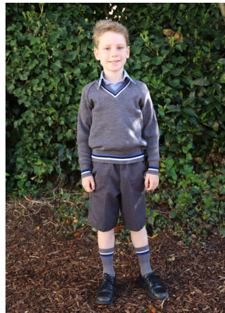
Boys Winter Uniform