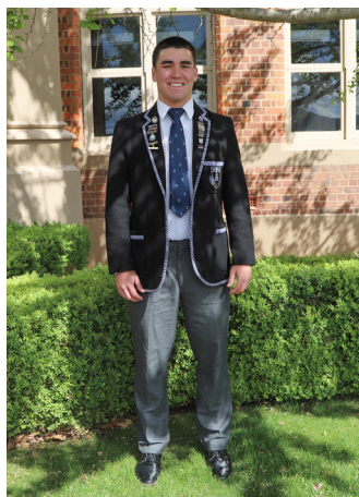
Boys Winter Uniform