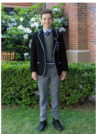
Boys Winter Uniform