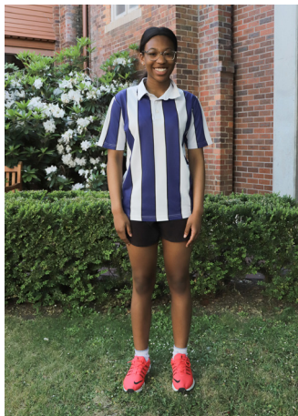
Unisex Sports Winter Uniform