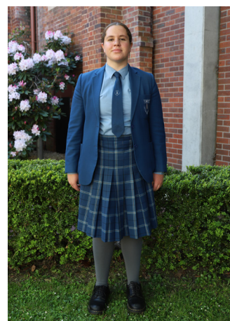
Girls Winter Uniform