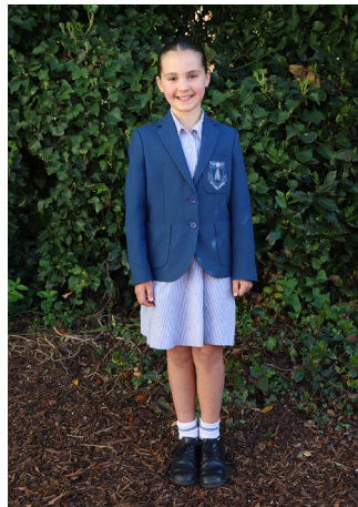
Girls Summer Uniform