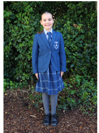
Girls Winter Uniform