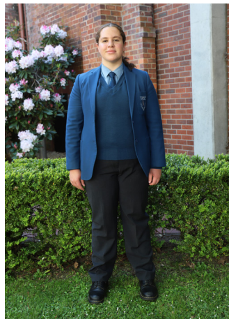
Girls Winter Pants Option