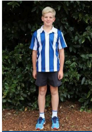
Unisex Sports Summer Uniform