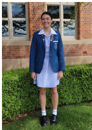
Girls Summer Uniform