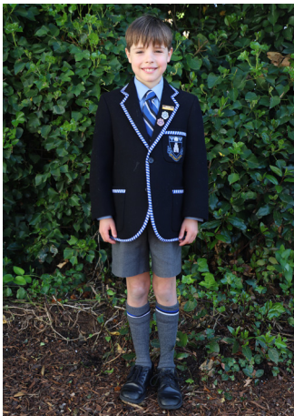
Boys Summer Uniform