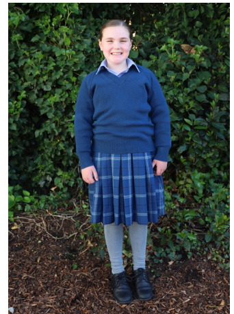
Girls Winter Uniform