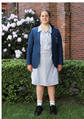
Girls Summer Uniform