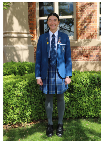
Girls Winter Uniform