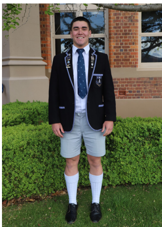
Boys Summer Uniform