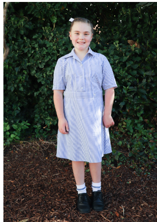
Girls Summer Uniform